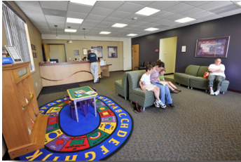
University Health Community Care Grain Valley