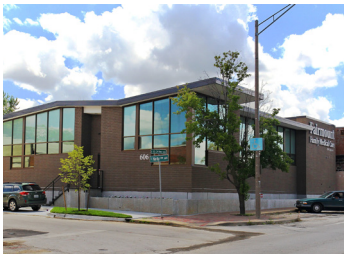
University Health Community Care Fairmount