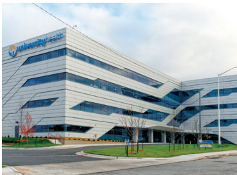
University Health 1